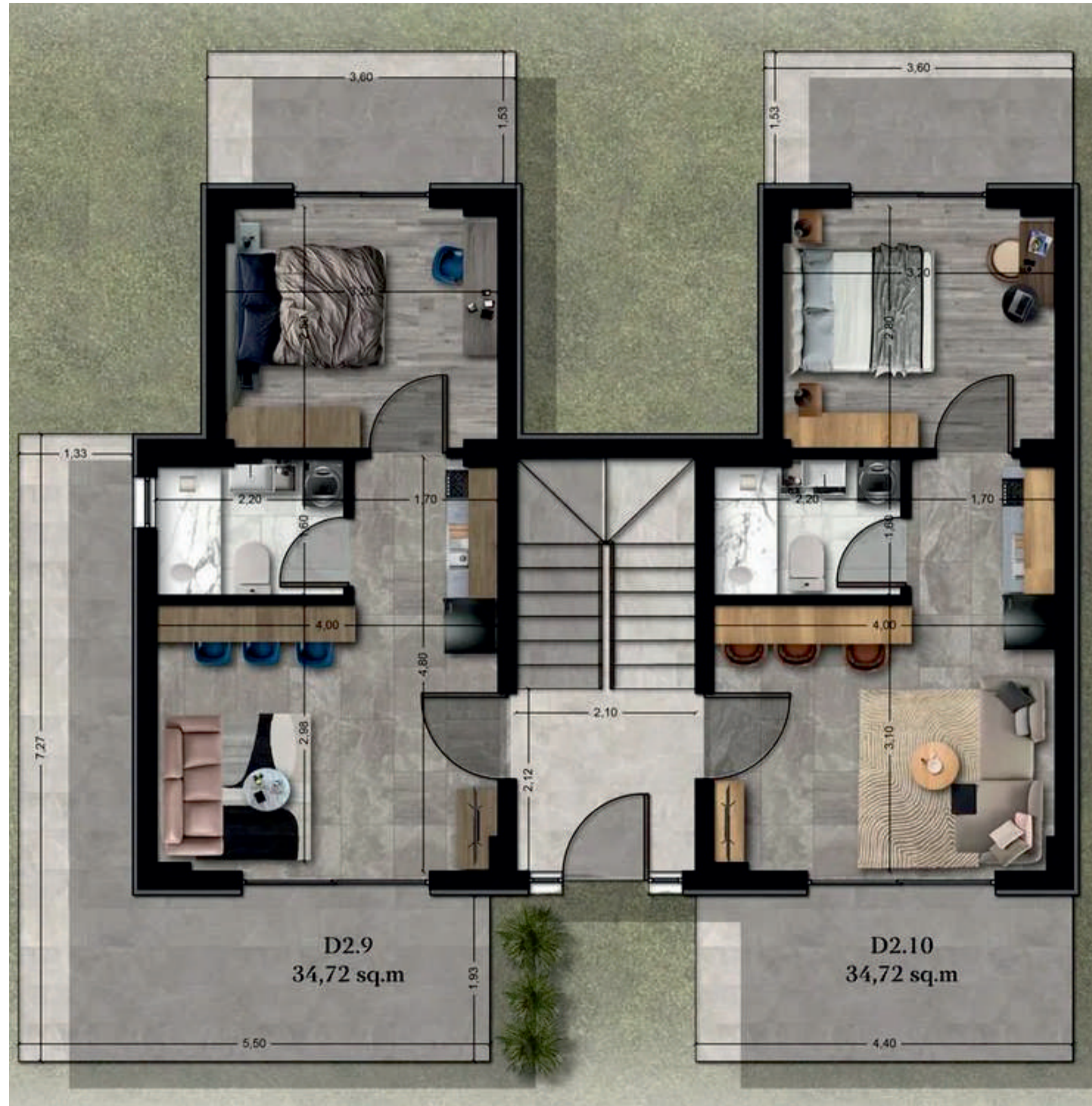
1 Bedroom | 1 Bathroom Starting from 87.500 €